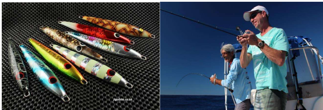
Above left; A selection of high end hand made Jigs from Japan